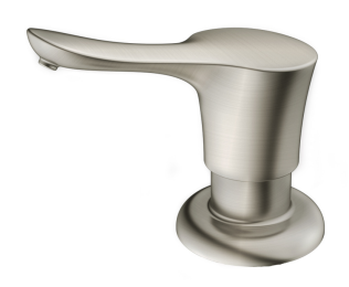
Model 441756 shown